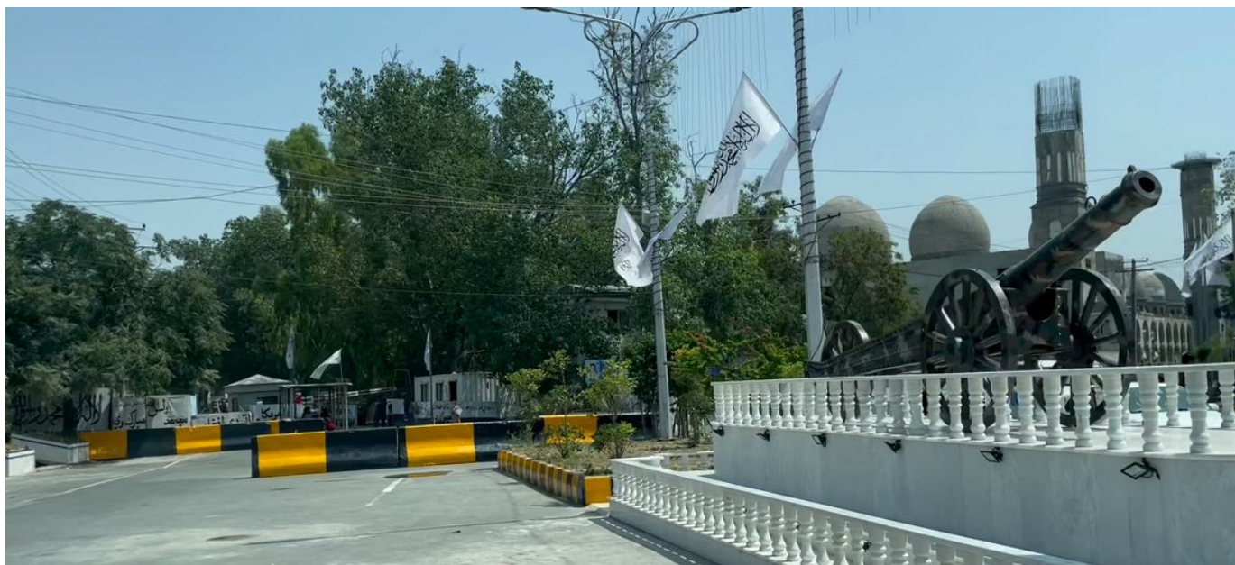
Flags of the de facto Taliban authorities fly outside the Governor's compound in Jalalabad, Afghanistan.